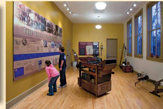
A timeline depicting significant events in the history of Lyles Station is displayed in the museum.