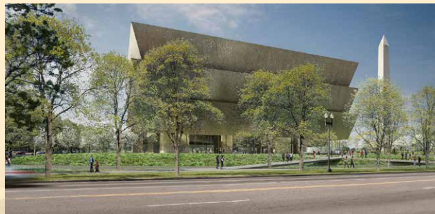
Architect's rendering of the new Smithsonian National Museum of African American History and Culture building under construction in Washington D.C. which will include several Lyles Station artifacts.