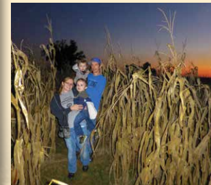
A 12-acre corn maze is just one of the many family activities enjoyed by visitors to Lyles Station throughout the year.