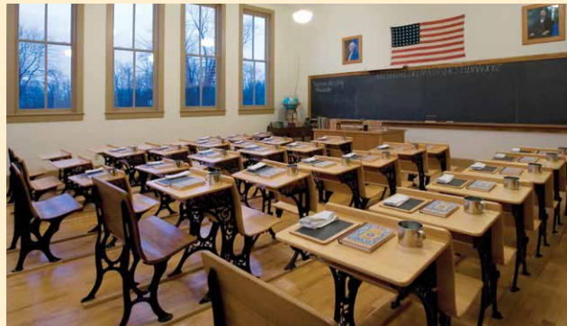
A 1920's-era school room has been recreated in the Heritage Classroom.

In 2015, the community of Lyles Station will have several artifacts on display as a part of an exhibit which will be included in the new Smithsonian National Museum of African American History and Culture in Washington, D.C.