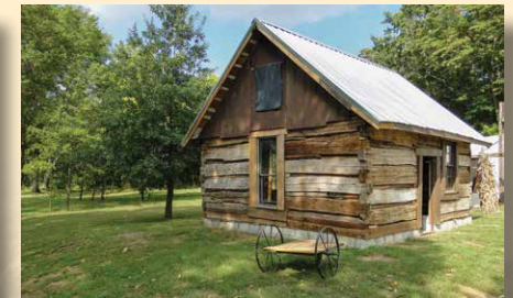
This log cabin, originally built in the Lyles Station community and later moved, has recently been reconstructed on the grounds of the school and houses visitor activities.